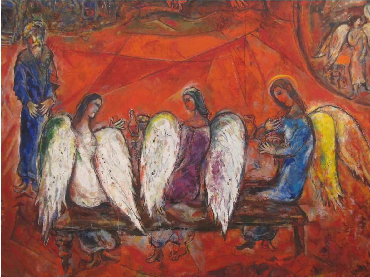
"Abraham and the Visitors at Mamre" by Marc Chagall, 1887-1985