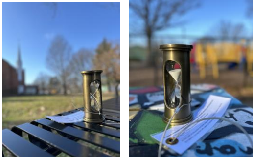
(These are in place until Easter.)

Find a peaceful spot at one of the memorial benches or picnic tables and allow yourself a few minutes, contemplate a thought-provoking prompt, and reconnect with yourself and the world around you. Take a Breath, Reflect, and Reconnect. Open to all, any time! Come solo, with friends, with your pup, or with family.