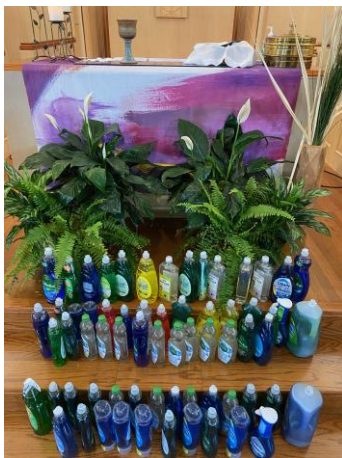
March Dish Soap Donations