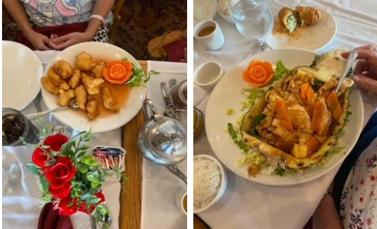
AUGUST'S DIVINE DINING

Everyone is invited to join EUMC's "Divine Diners" for drop-in dining. This month we'll meet for lunch Tuesday, September 12, 12 noon at Sammy's, and dinner Tuesday, September 26, 5:30 p.m. at Adam's, both in the Eastport Shopping Center.