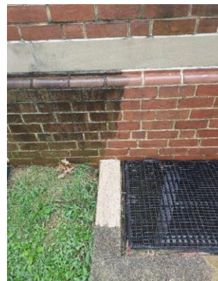
BEFORE AND AFTER CLEANING/POWER WASHING.