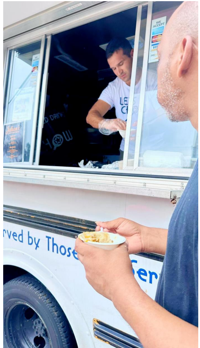
LET'S CHOW TRUCK IN THE EUMC PARKING LOT