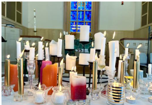
Honoring our Saints